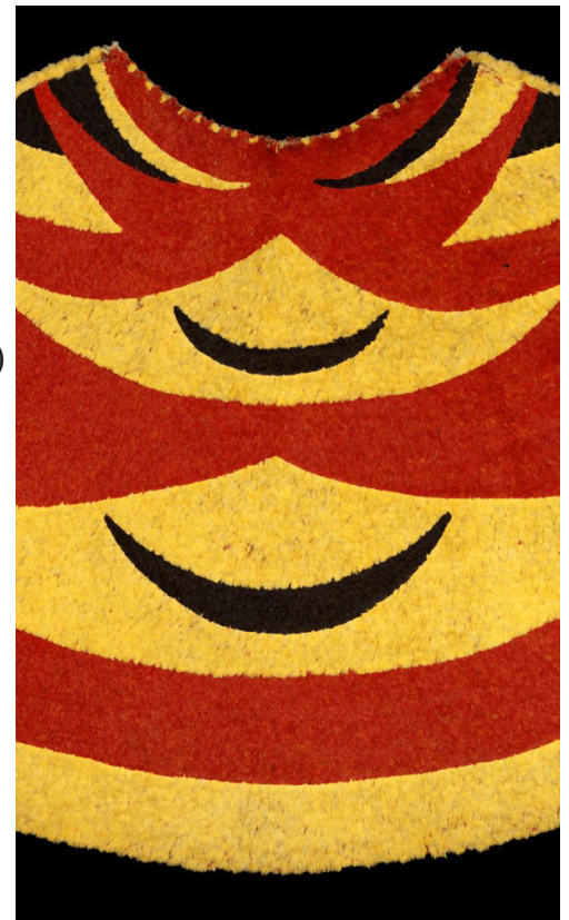
Detail of the Ahu'ula