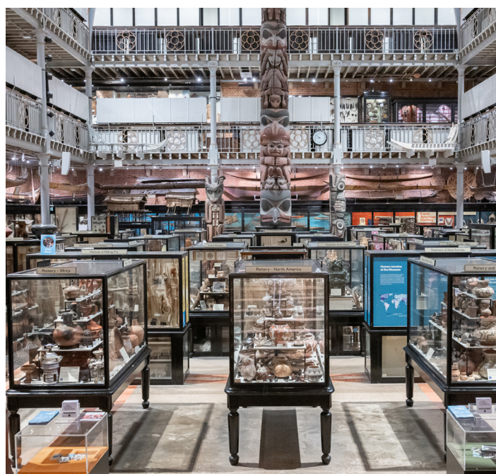
Interior of Pitt Rivers Museum

The challenge is for teachers to use objects to develop culturally enriching, relevant and practical learning opportunities across the curriculum.