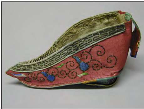
Shoe, China, 1941.8.045

Bound feet were painful and sometimes crippling, and their unpleasant smell, caused by the binding, had to be masked with perfume.