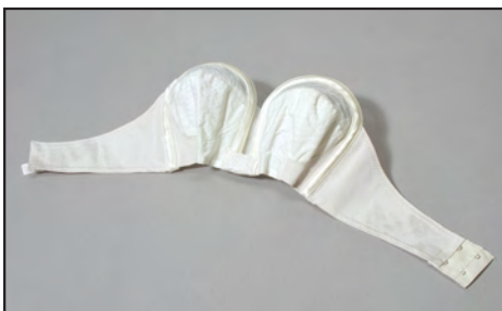
2002.24.1 Bullet bra, USA

This 'bullet' or 'sweater' bra was designed to give women the torpedo-shaped, pointy breasts in vogue during the 1950s. Also pictured here is a pair of shoulder pads. During the 1980s shoulder pads were stitched to the inside of clothing, giving the wearer the