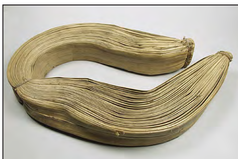
Bustle, Tuvalu, 1901.24.12