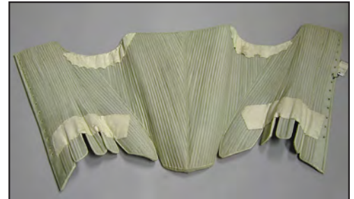
Nineteenth century corset, UK, 1930.84.2

Throughout history clothes have been used to alter the shape of the human body. The corset was first introduced into Europe in the fifteenth century, but clothes designed to reduce the size of the waist date back thousands of years. Corsets constrict the waist and, according to fashion, either flatten or push out the breasts. In the eighteenth and nineteenth century corsets were so stiff and constricting they permanently changed the shape of the skeleton and the internal organs causing serious health problems.