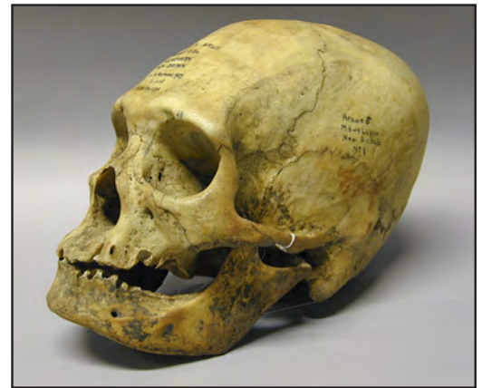
Male skull showing effects of headbinding, Papua New Guinea, 1938.36.1288

The shape of the child's head also varied. If the mother wished her child to have a very long head, she pulled the bandage very tight. Elongated heads were considered attractive to the opposite sex. The heads of girls were usually made longer than those of boys, and hairstyles would also accentuate the shape.