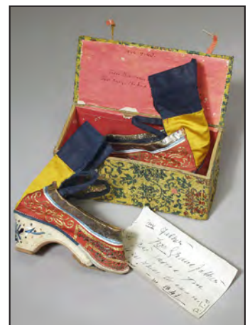
Shoes, China, 1944.9.63

Foot-binding was formally outlawed in 1911, but the practice continued into the twentieth century, until calls for reform and an anti-footbinding movement emerged. The abolition forced women to unbind their feet, an act almost as painful as the initial binding.