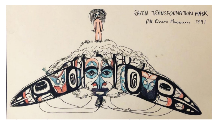
Raven Mask