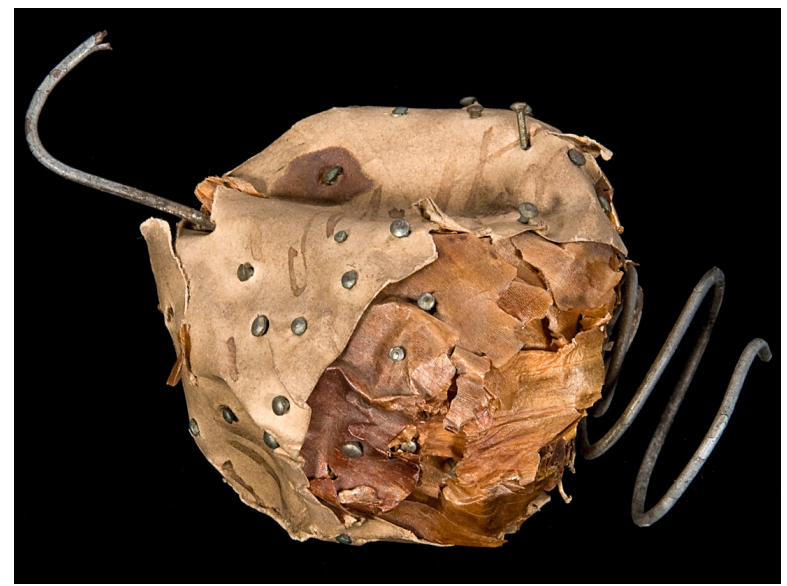
Figure 1. The onion from the chimney of the Barley Mow (PRM 1917:53:776)

Il human cultures have models of reality: ways in which they think the world works, of cause and effect, of the balance between physical and cosmological forces, and notions of how people should act to obtain the results they want without contravening any social or cosmological precepts. Models of reality are not just ideas in people's heads, but are worked through in action and are hence instantiated in objects. The Pitt Rivers Museum has often been conceived of as a record of