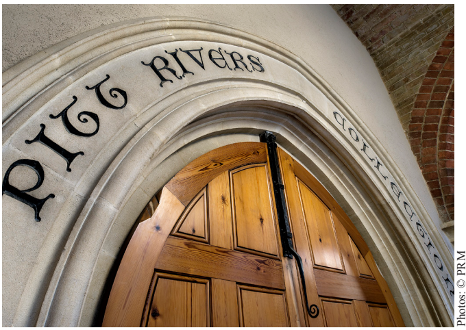
The entrance to the Pitt River Museum