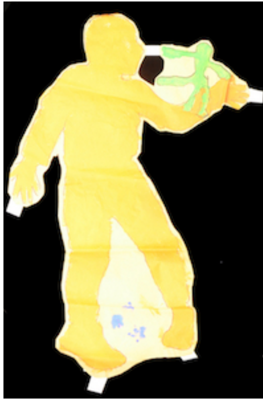
One of the 'Paper People', a series of cut-out figures made at and installed across the 'Jungle' to mark the destruction of the shelters of hundreds of unaccompanied children when the southern section of the camp was cleared in March 2016—during which an estimated 129 unaccompanied children went missing (on loan from artist/co-curator Sue Partridge)