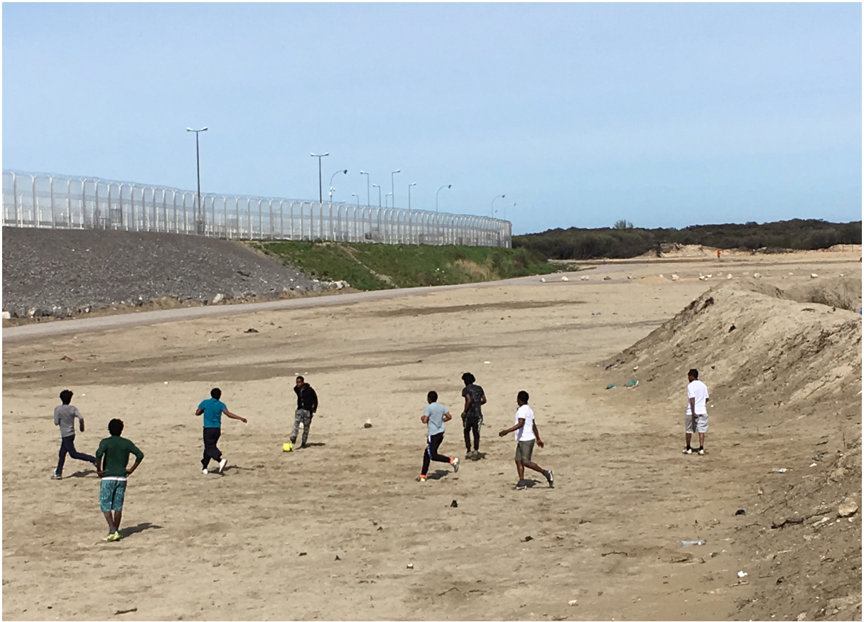
One of more than 200 photographs to be displayed in the exhibition, from the archive taken by activist and co-curator Caroline Gregory, during the two years that she spent living and volunteering at the 'Jungle'.