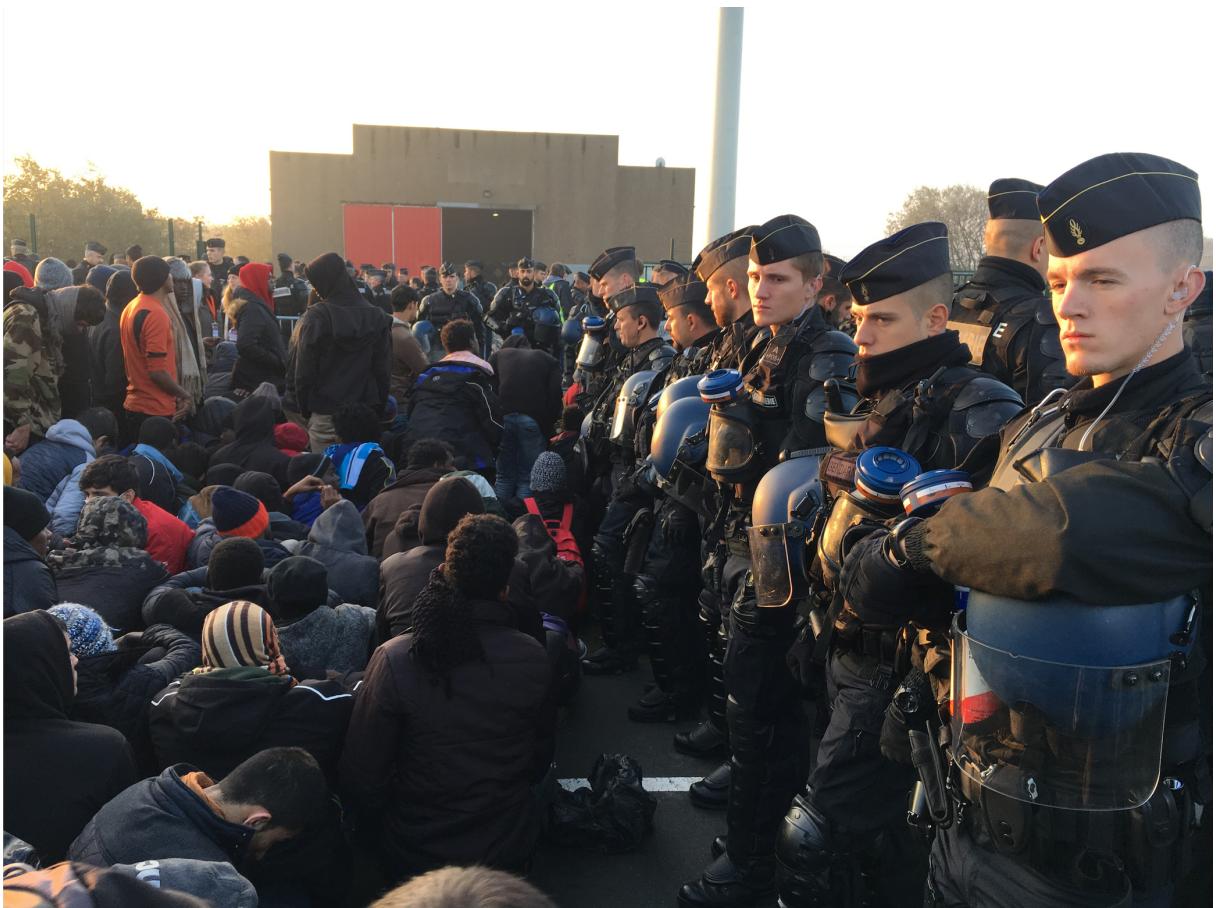
One of more than 200 photographs to be displayed in the exhibition, from the archive taken by activist and co-curator Caroline Gregory, during the two years that she spent living and volunteering at the 'Jungle'.