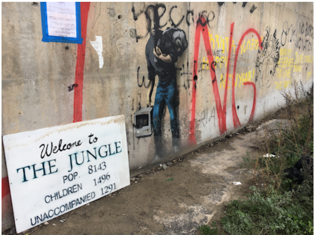
One of more than 200 photographs to be displayed in the exhibition, from the archive taken by activist and co-curator Caroline Gregory, during the two years that she spent living and volunteering at the 'Jungle'.