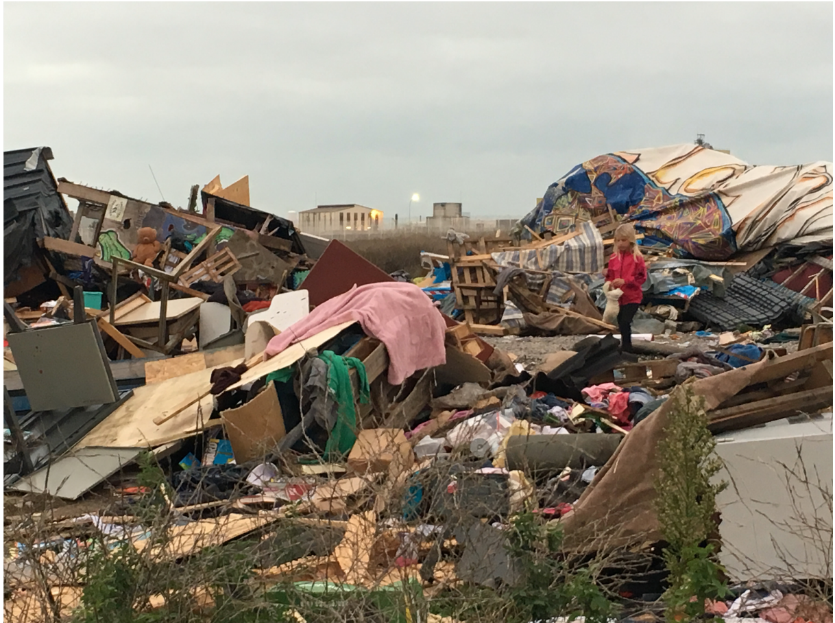
One of more than 200 photographs to be displayed in the exhibition, from the archive taken by activist and co-curator Caroline Gregory, during the two years that she spent living and volunteering at the 'Jungle'.