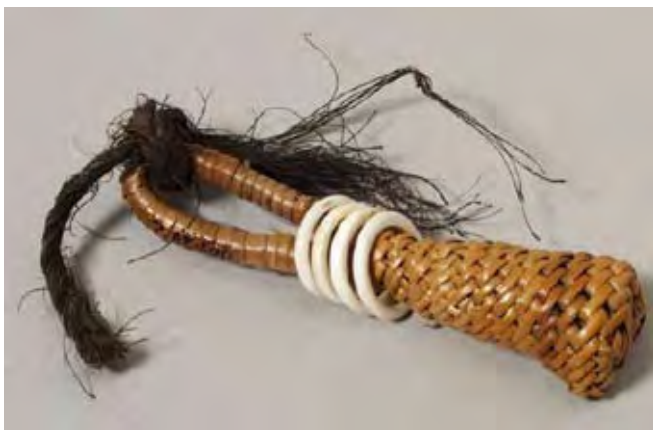
▲ Santa Isabel Island, Solomon Islands, Melanesia, Oceania; 1904.29.2