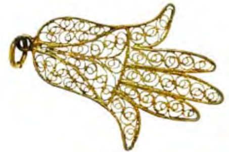
▲ Tunis, Tunisia, Africa; 1917.9.74

The Hand of Fatima, here in gold filigree, is a common symbol in Islamic countries.