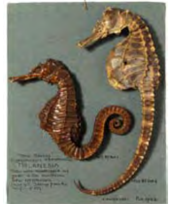
Vanuatu, ▶ Oceania Melanesia; 1923.87.340.1-2