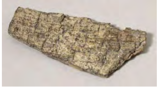
▲ D'Entrecasteaux Islands, Melanesia, Oceania; 1913.88.342