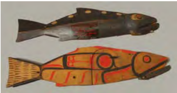
▲ Queen Charlotte Islands, British Columbia, Canada, N. America; 1891.49.35

represent animals and fish that are assigned to the various Orokolo clans. They are normally carried in a small string bag, with the mouth and nose sticking out of the end. Aromatic bark, flat seeds, or small pieces of bone from a magic man are sometimes stuck in the mouth of the marupai to make it more powerful. They are used for many magical purposes: keeping evil spirits away from gardens; for assistance and good luck when hunting wild pigs; to magically draw specific types of fish to the shore; to bring good health through disease protection; to bring good weather; and, in some cases, to bring about the death of the owner's enemies.