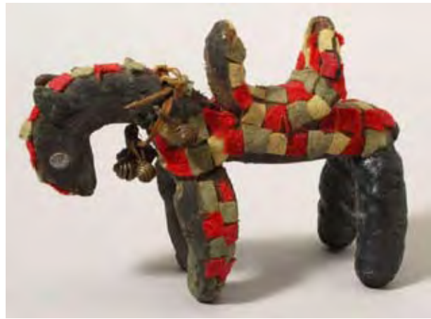
▲ Benue Wukari, Nigeria; Africa, 1932.18.21

This amulet comprises a rubber horse with a saddle, decorated with small square pieces of red, green and yellow textile. It has a leather thong around its neck with small 'charms' consisting of pieces of wound metal wire. The horse's eyes are metal nails. It represents a 'night horse', and was used in the rituals of the Mba tsav secret society of the Tiv people of Nigeria. One of the beliefs of the society was that they could mount this horse, become invisible, and travel long distances at night in order to kill a victim and return unnoticed.