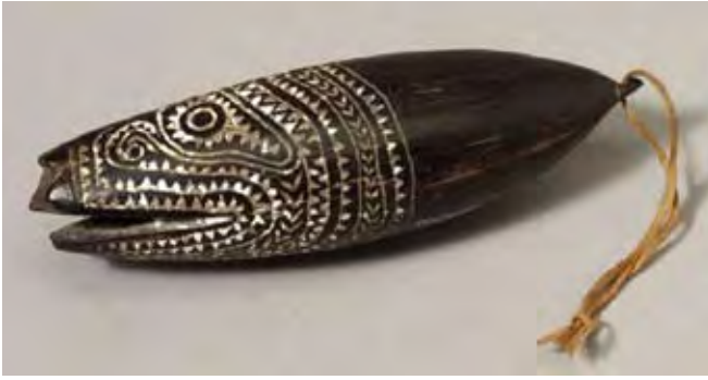
▲ Orokolo, Papua New Guinea, Melanesia, Oceania; 1938.36.278

This amulet is made from a dwarf coconut, carved with clan motifs and rubbed with lime to emphasise the design. Known as marupai , such amulets are still used for magical purposes in Papua New Guinea today. They are usually passed from uncles to nephews, and the carved designs