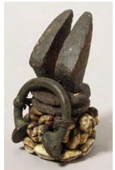
▲ Nigeria, Africa; 1916.45.110

reported that they had been described to him as ‘blacksmiths’ mascots’, and would bring financial prosperity as well as protection from evil forces.