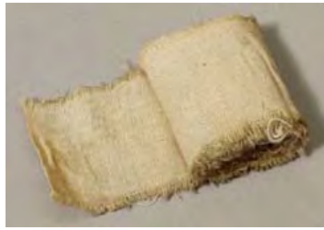
▲ Mount Kenya, Kenya, Africa; 1913.5.69