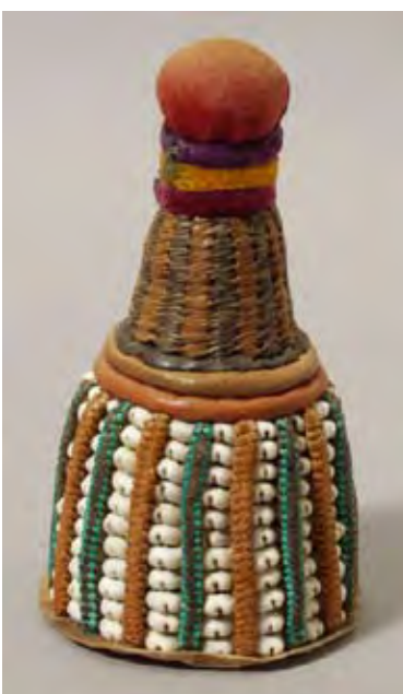
◀ Ibadan, Nigeria; 1930.34.1

This Yoruba amulet box or ori consists of woven leather strips and rows of cowrie shells as the base. It has three leather rings in the middle and three velvet rings (maroon, yellow and purple) at the top, with a red textile stopper. It was used as a container for amulets and charms. The original owner of this ori assured the collector that it is filled with ‘juju’, or protective amulets and charms, but could not tell him exactly what was inside.