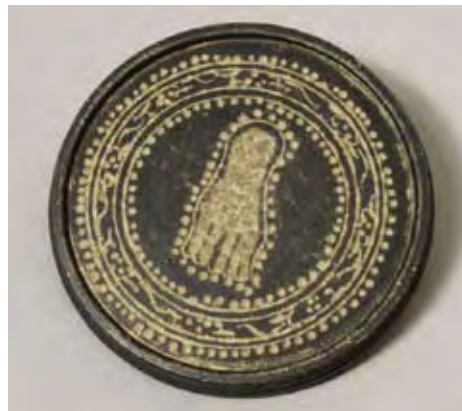
▲ Buddh Gaya, Bihar, India; 1892.41.280

This charm, from a Shinto shrine in Japan, comprises a packet of red silk decorated with gold thread. It is meant to bring good luck and success in passing exams and other academic endeavours. The Shinto religion is thought to be indigenous to Japan and is as old as Japanese culture. There are no organised structures of belief or practice, simply a system of cultural beliefs to help guide individuals through their lives.