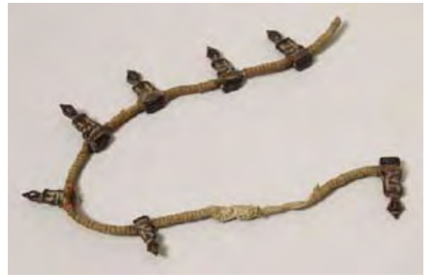
▲ Myanmar (Burma), Asia; 1949.8.1

This plaited cord has seven small figures of Buddha woven into it at regular intervals. Buddhism is practised all over the world, but primarily in India, Central and Southeast Asia, China, Korea, and Japan. This amulet was worn to protect against death in battle.