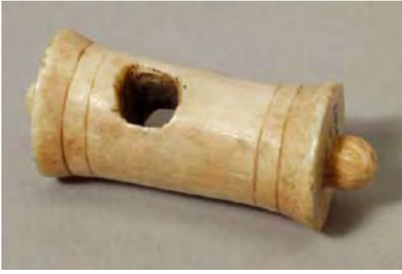
▲ Kenya/Tanzania, Africa; 1898.66.9

This amulet, from the Maasai people of Kenya and Tanzania, is made from ivory and was hung around the neck of a cow. The Maasai are pastoralists who depend, for their diet, on the