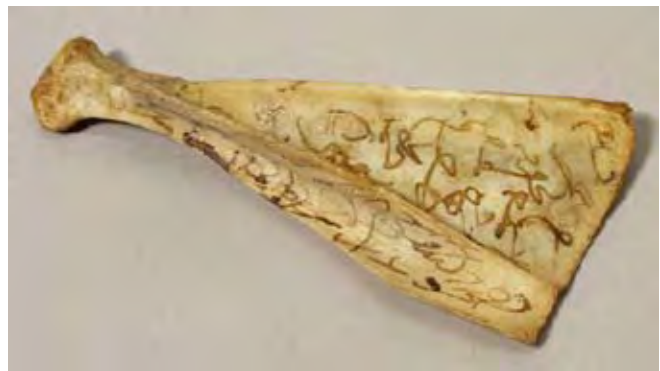
▲ el Kantara, Aurès Mountains, Algeria, Africa; 1920.42.15