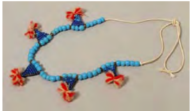
▲ Istanbul, Turkey, Asia; 1903.7.1

This amulet consists of a string of blue beads, intermittently strung with five triangles of blue beadwork with tufts of red and white yarn at the points. It was hung around the neck of a donkey, and would have been used to protect it, as animals could also sometimes be victims of the Evil Eye.