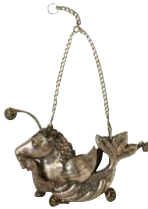
◀ Naples, Italy, Europe; 1924.11.2

This cast-silver amulet of a mythological sea-horse or hippocampus, has five pellet bells hanging from the body, at various points, and is suspended from a silver linked chain. The hippocampus is a sea monster – a combination of a horse's forequarters with the hindquarters of a fish – with origins in Greek mythology, where the hippocampi were believed to have pulled the chariot of Poseidon, the god of the sea. In some cases, later features were added, including wings