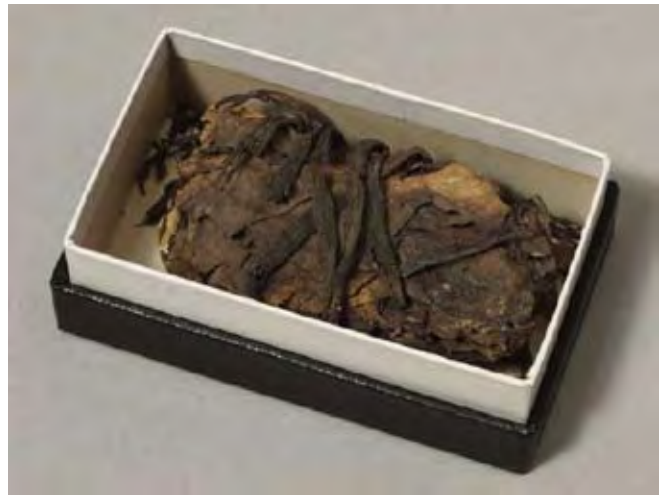
▲ Tesophenyu, Nagaland, India; 1928.69.1584

This object was created to be placed in the spring of a Rengma Naga village called Tesophenyu. The poisonous potions of the Rengma Nagas were composed of a mixture of things taken from plants, insects, animals and their own bodies. Here the wrappings contain a mixture of things that were considered powerful enough to cause malevolent events: the hair of the witch who made it; earth from the grave of a man killed by a tiger and a woman who died in childbirth; leaves of the agunnu tree, which withers quickly; a piece of giant taro, which causes stomach irritation when eaten; a nettle leaf; and a leaf of the tree known as the 'flame