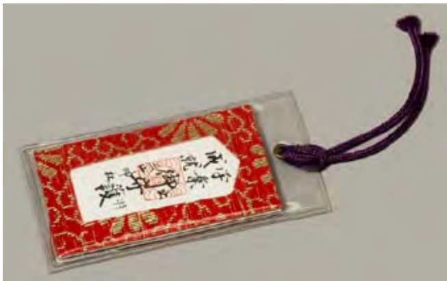
▲ Tohoku District, Northern Japan; 1976.10.5

of the forest' because it sheds its leaves suddenly. Some of these items have a symbolic magical meaning, and others are examples of sympathetic magic.