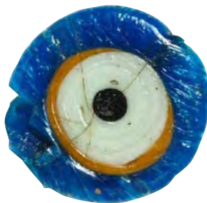
▲ Hebron, Israel/Palestine, Asia; 1885.3.4

This glass amulet is meant to look like an eye, and thus uses sympathetic principles to attract the Evil Eye, protecting the owner from receiving a malicious glance. It has three concentric coloured rings (white, yellow and blue) surrounding a black 'pupil'. It was donated to the Museum's collections in 1885; but amulets of this kind continue to be manufactured and used in this way in many areas of the Middle East today.