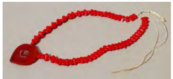
▲ Al-Fayyum al-Lahun, Egypt, Africa; 1933.58.8

This string of red glass beads (possibly made in imitation of coral), with a red glass pendant inscribed with a crescent and a star, was worn by an Egyptian woman whose spirit was possessed by a sheikh . The sheikh was a holy person who had magical powers when he was alive and who was sometimes believed to possess people after his death. This charm would cause the sheikh to treat the woman kindly, and to prevent him from making her ill. If someone believed they were possessed they could go to a magician who would interpret messages from the sheikh and gave directions about what to do to please him.