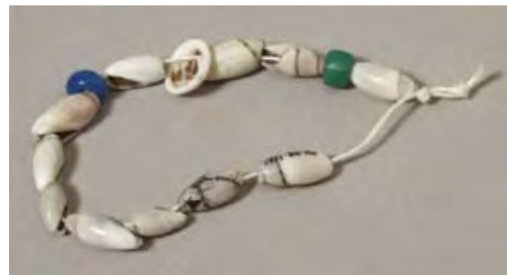
▲ McDowell Reservation, Arizona, USA, N. America; 1911.86.111

This object was made by an artist of the Haida people who live on islands off the west coast of Canada. Salmon are one of their main food sources, and this object, made from wood and painted to represent a salmon, was used in a ritual to draw the salmon up the river during periods when salmon were scarce. A chief, carrying the carved salmon, and a shaman would lead the people to the beach. The ceremony involved dancing and singing while the shaman addressed the water spirits.