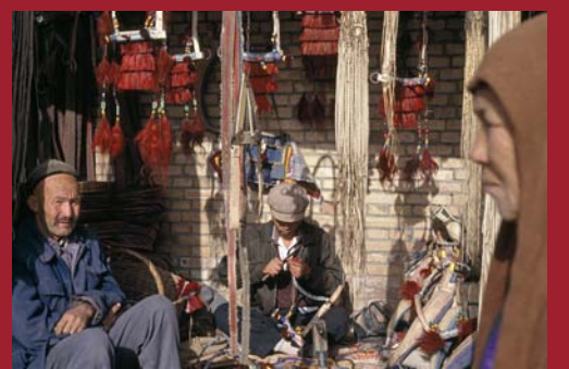
People at a trader's stall in Kashgar, making and selling horse-trappings. China. 1994.