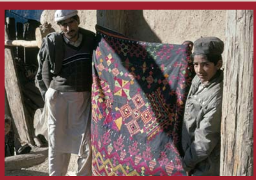
A man and boy holding an embroidered textile typical of the Palas valley in north-western Pakistan. 1993.