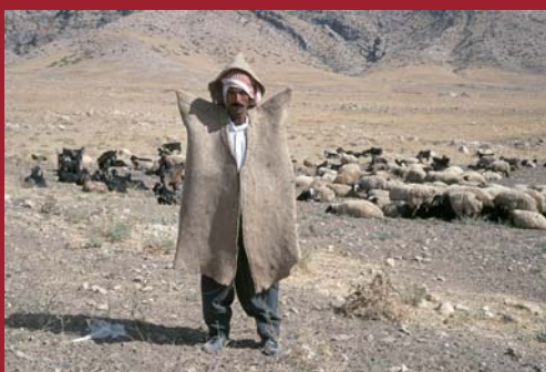
Kurdish shepherd wearing a traditional felt coat. Iraq. 1992.